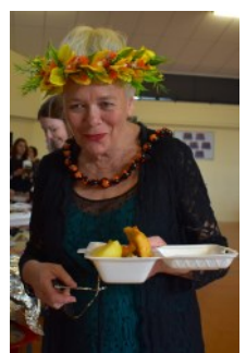
Matariki and Hangi 2018