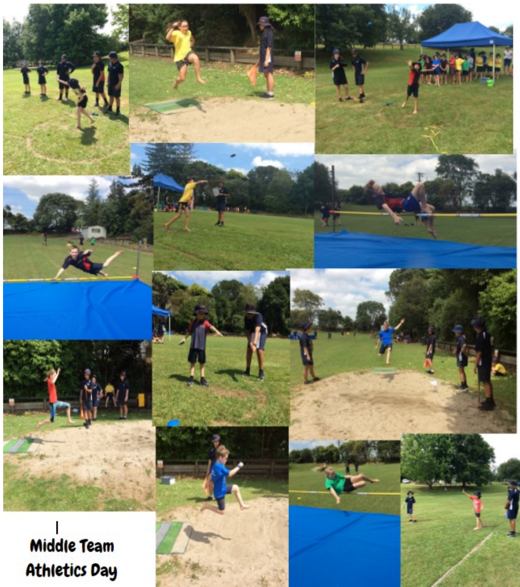
| Middle Team Athletics Day