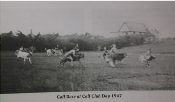
Calf Race at Calf Club Day 1947