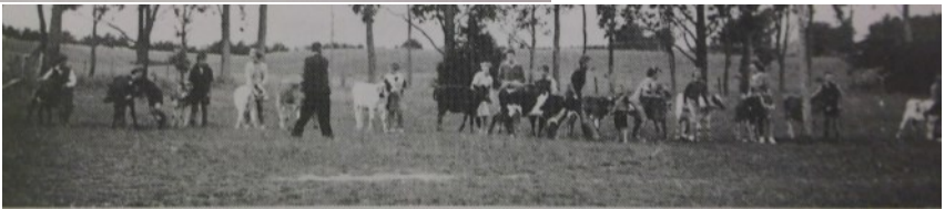
Lining up for the Calf Race at Calf Club Day 1947.