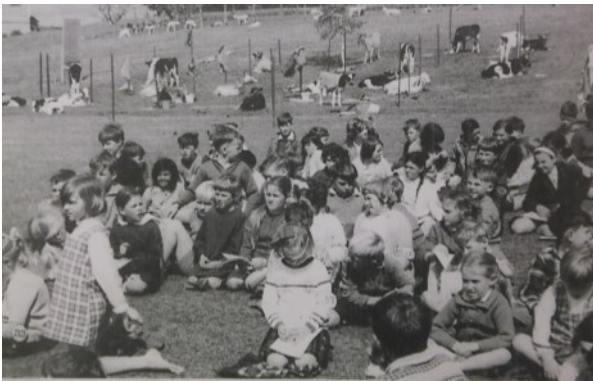
Calf Club 1969