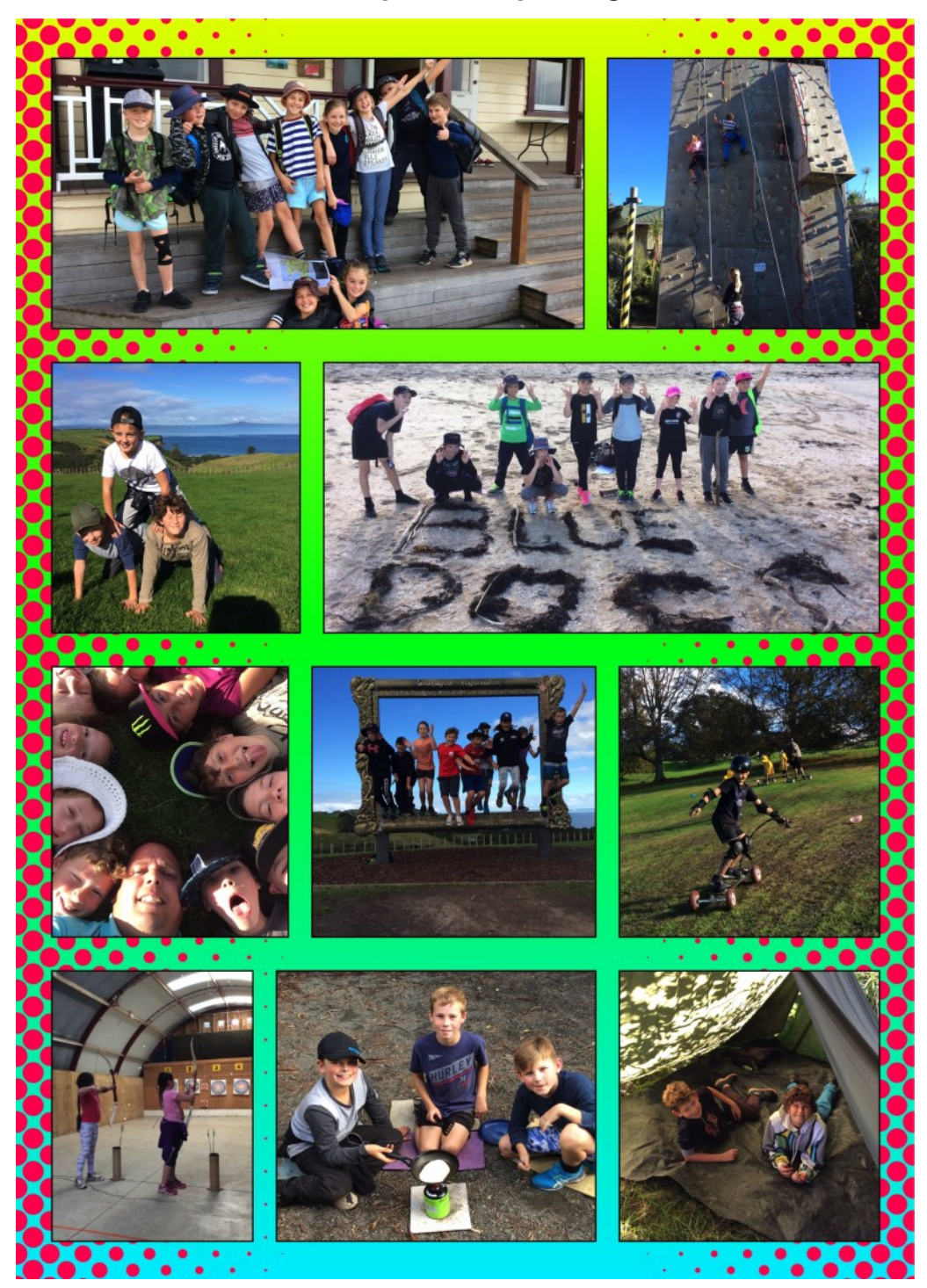
Year 5 and 6 camp to Shakespear Regional Park