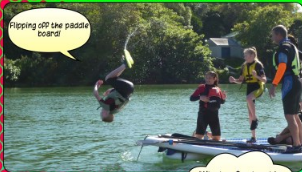
Flipping off the paddle board!