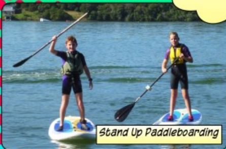
Stand Up Paddleboarding

What a Fantastic day!! Thanks Youthtown and all our parent helpers!